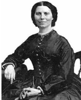
Clara Barton, c. 1866

Clarissa "Clara" Barton was born in 1821 in Massachusetts. She became an educator in 1838. Barton became interested in providing a good education for all children in the community while visiting a friend in Bordentown, NJ. Although laws existed in New Jersey for free public education, they were never implemented. There were private schools for the wealthy and pauper schools for others. Barton started the nation's first free public school in Bordentown in 1852 with six children and a one-room school house. By the following year, there were over 600 children in the program, receiving lessons from teachers housed in locations all over the city.