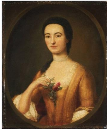
Portrait of Annis Boudinot Stockton

Born in 1736, Annis Boudinot married Richard Stockton, an attorney from an elite Princeton, New Jersey family. Annis was one of the first women to be published in the Thirteen Colonies. She wrote and published her poems in leading newspapers and magazines of the day and was part of a Mid-Atlantic writing circle. She was the author of more than 120 works, but it was not until 1985, when a manuscript copybook long held privately was given to the New Jersey Historical Society, that most of her works became known. Before that, she was known to have written 40 poems. Annis became known as the "Duchess of Morven", the name of the Stockton estate in Princeton, New Jersey. They entertained prominent guests, including George Washington, with whom she had a correspondence, including numerous poems. She died in 1801.