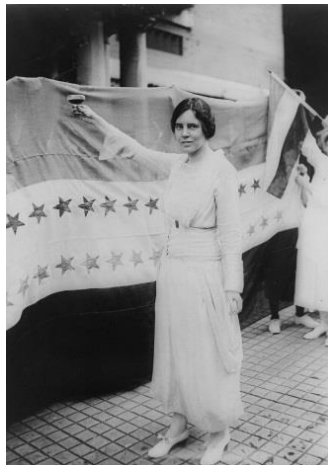
Alice Paul, 1920

Alice Paul was born in 1885 to a Quaker family. Her father was a successful businessman and the family lived at Paulsdale, a 173-acre farm in Mt. Laurel, New Jersey. Her Quaker family supported gender equality and the need to work for the betterment of society. Alice Paul graduated from Swarthmore College and was the commencement speaker. She worked in the settlement movement in New York and went to study social work in England, where she met radical suffragettes, who were taking public action such as protests to bring attention to the secondary status of women. Paul joined the movement and was arrested several times.