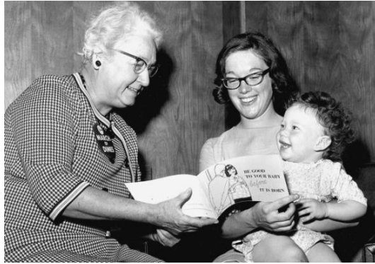
As part of the March of Dimes campaign to prevent birth defects, Dr. Apgar advises mother to “Be Good to Your Baby before It is Born;” c. 1986

Virginia Apgar was born in 1909 in Westfield, NJ, where she was raised. She graduated from Mount Holyoke College, where she studied zoology with minors in physiology and chemistry, and from the Columbia University College of Physicians in 1933. In 1949, Apgar became the first woman to become a full professor at the Columbia University’s medical college, where she did clinical and research work. In 1953, she introduced the first test, called the Apgar score, to assess the health of newborn babies. The Apgar score is calculated based on an infant's condition at one minute and five minutes after birth.